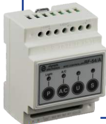
RF-54/A Door lock, lighting & A/C control unit (2x25A)