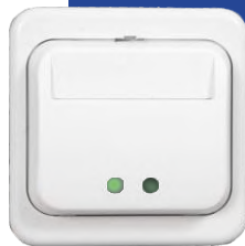
RF-53/A RFID card reader for RF-54/A