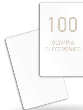
RF-50/T Laser printed control card for lighting & A/C for: RF-52/A RF-52/A/D RF-53/A