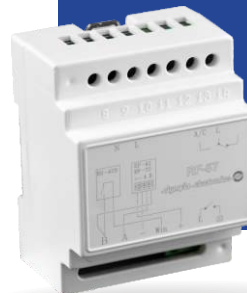
RF-57/A Control unit for lighting & A/C